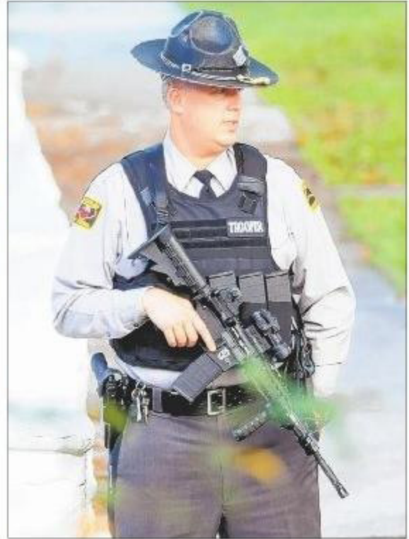
Wilmington police and a North Carolina state trooper at the scene of Tuesday's fatal shooting at Ninth and Dock.